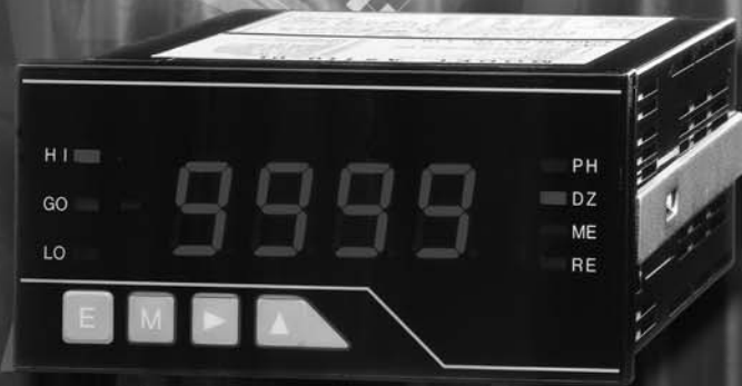
Display single type (A5X1X-XX)