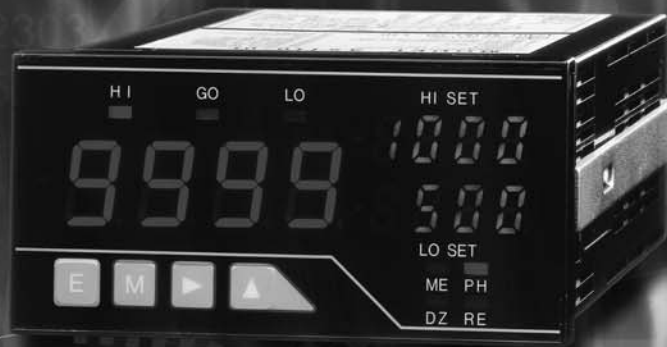
Display multiple type (A5X2X-XX)