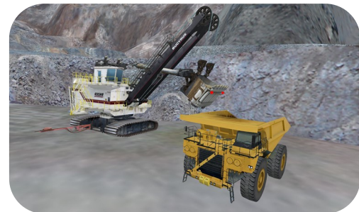
Positioning the Truck for loading by the interactive Electric Rope Shovel