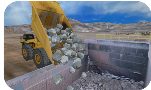
Mastering the use of the hoist control for dumping