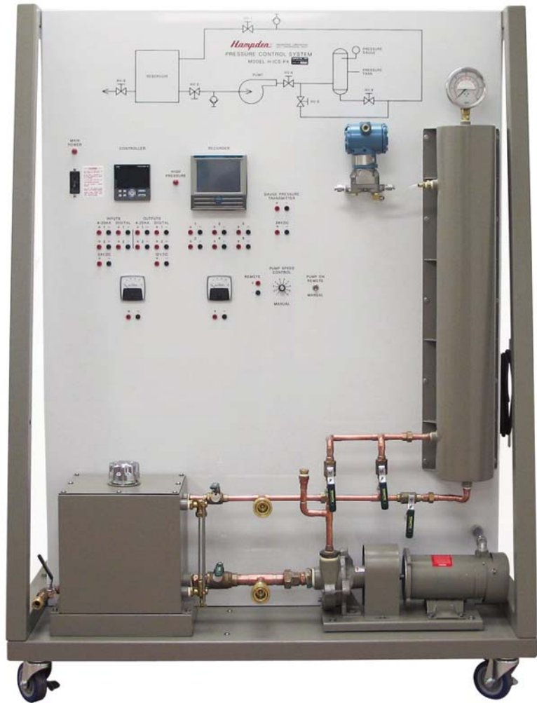
MODEL H-ICS-PX Pressure Control Trainer Dimensions: 72"H x 48"W x 34"D Shipping Weight: 920 lbs.

Vessel pressure is indicated directly by a 0-15 gauge. In addition, pressure is sensed by a Rosemount pressure transmitter, which transmits a 4-20 mA signal, directly proportional to pressure. This signal is received by both a 6-channel-chart recorder and a microprocessor-based controller.