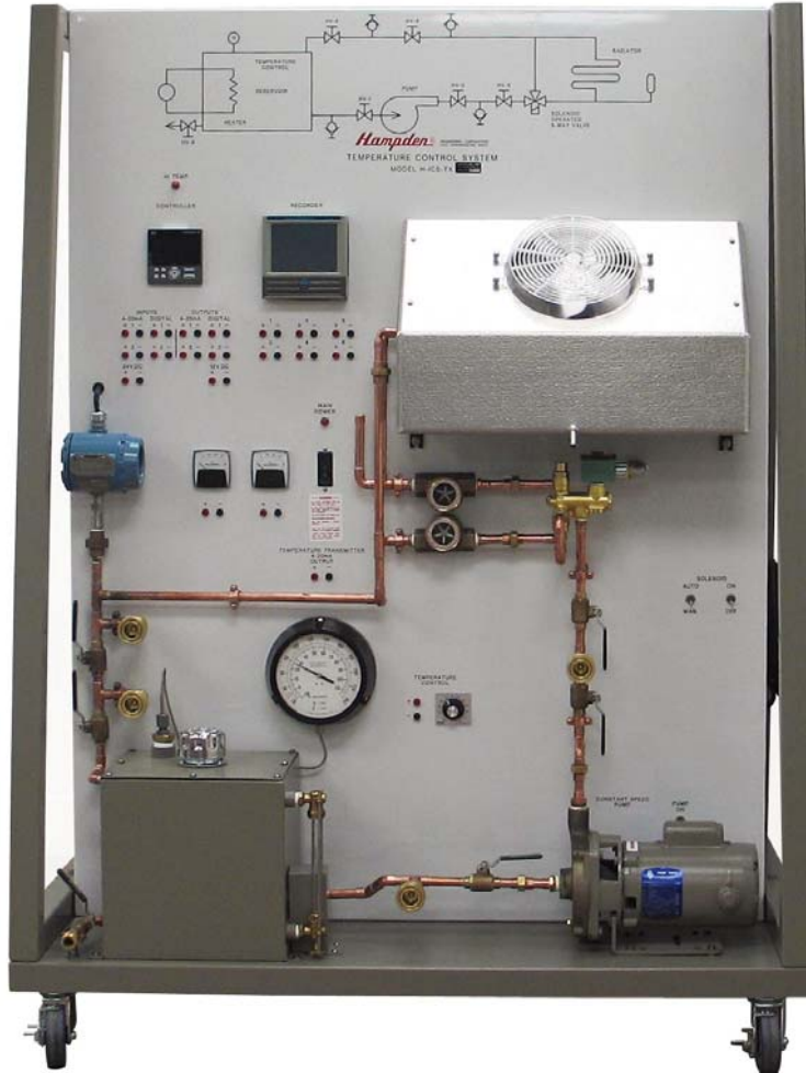
Hampden MODEL H-ICS-TX Temperature Control Trainer Dimensions: 72"H x 48"W x 34"D Shipping Weight: 920 lbs.

Water temperature is measured by a thermocouple. The thermocouple outputs a millivolt signal proportional to temperature. This signal is received by a thermocouple transmitter which transmits a 4-20 mA signal to both a 6-channel-chart recorder and a microprocessor-based controller.