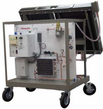
MODEL H-SST-1A Front view showing components Overall Dimensions: 72"H x 48"W x 34"D Shipping Weight: 450 lbs.