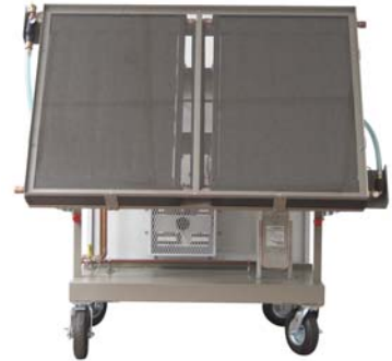
MODEL H-SST-1A Back view showing solar collector tilted toward sun

The Hampden Model H-SST-1A Solar System Trainer is an actual solar hot water heating system. System components include a solar collector, circulation pumps, storage tank, heat exchanger, air separator, air handler, solar heating coil, automatic air vents, thermostat, and a control panel with sensors. Gauges, thermometers, and flowmeters permit students to observe pressures, temperatures, and flow rate while the system is in operation. The trainer is mounted on a mobile frame and the collector panel is adjustable for easy positioning in direct sunlight. An electrical fault package option can be added, specify H-SST-1A-FP . A Computer Data Logging Option can be added, specify H-SST-1A-CDL .