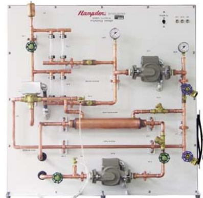
MODEL H-HYD-1A Dimensions: 36"H x 36"W x 13"D Shipping Weight: 290 lbs.

The Hampden Model H-SHST-1 Solar Heat Service Trainer contains the actual control components of a solar heating system, including: sensors, relays and thermostats. Each component terminates at Hampden binding posts for easy interconnection into several configurations. Up to 21 faults may be inserted from the panel on the side. Furnished with cords.