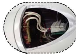
Cutaway view of wind turbine generator

The Control Panel consists of a main AC circuit breaker, blower speed control, wind turbine output voltage and current meters, four Hampden HR-1S color coded socket receptacles connected