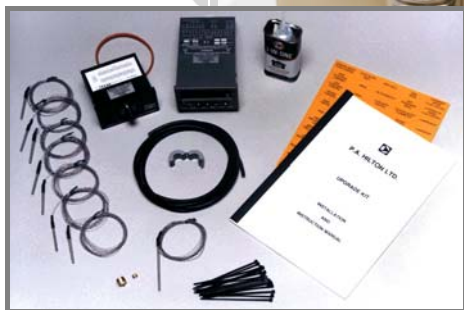
Insert 1: Optional Digital Temperature Indicator upgrade. R634A