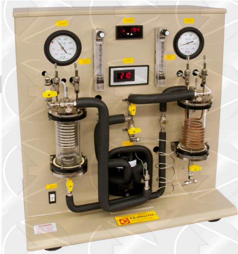
Figure 1: R634 Unit shown with R634A and R634B fitted