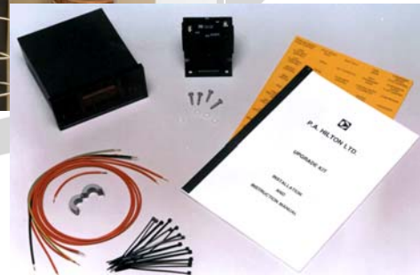
Insert 2: Optional Digital Wattmeter Upgrade R634B