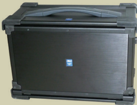
Portable, compact and robust MIL-STD 810F housing