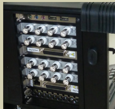
All in one Transient Recorder with very high channel density